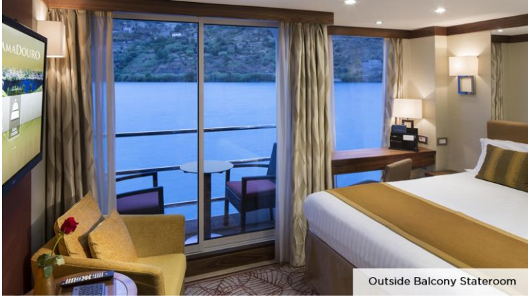
Outside Balcony Stateroom

7-night cruise | October 21-28, 2023 | Aboard AmaDouro