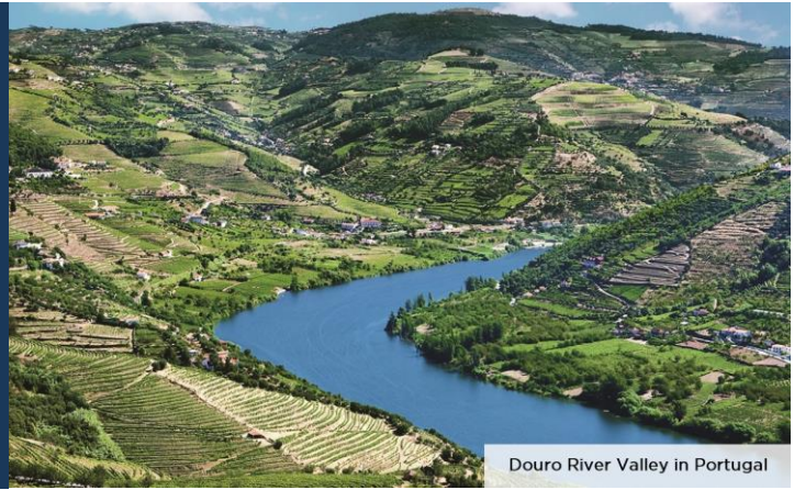
Douro River Valley in Portugal

7-night river cruise roundtrip from Vila Nova de Gaia (Porto) October 21-28, 2023 | AmaDouro