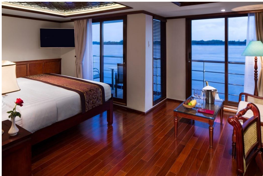
Category A & B Balcony Cabins