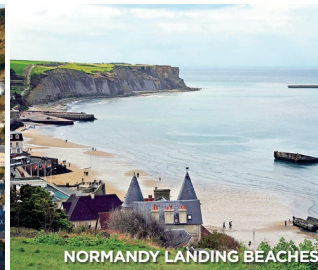
NORMANDY LANDING BEACHES