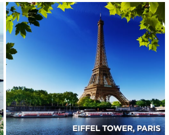
EIFFEL TOWER, PARIS